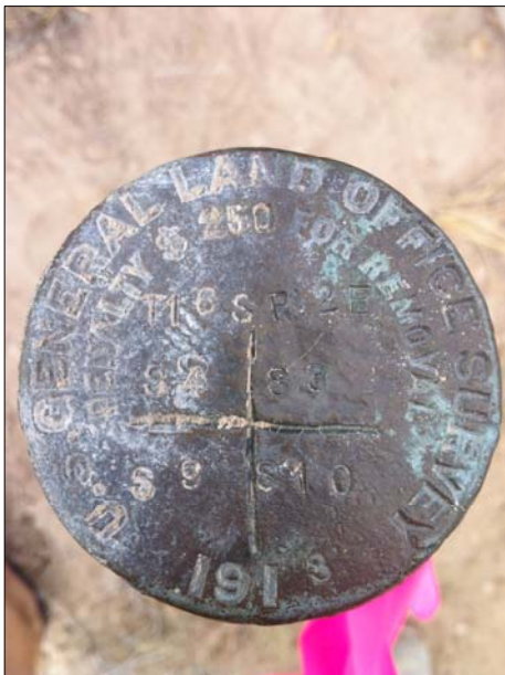
Corner Monument Markings - Photo View or Stamping on Cap

South 1/4 Corner of Section 3, T16S, R12E, S.L.B.&M. (Steel Spike)