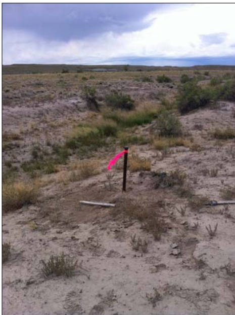
PHOTO OF CORNER