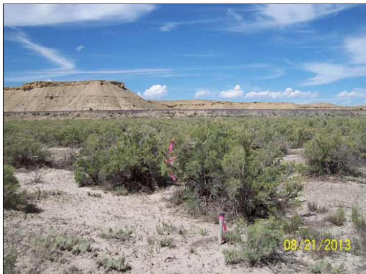
PHOTO OF CORNER

BLM POINT ID (GCDB): UT260160S0120E0_400700