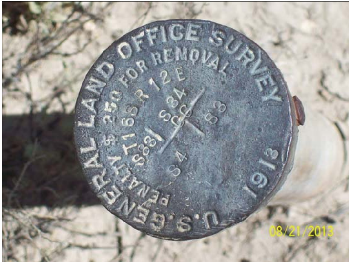
Corner Monument Markings - Photo View or Stamping on Cap