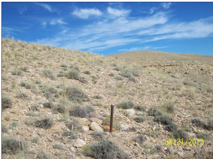
PHOTO OF CORNER

CERTIFICATION This is to certify that this record was prepared from field notes of actual surveys made by me or under my direct supervision and that the same is true and correct to the best of my knowledge and belief.