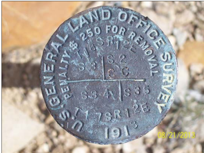
Corner Monument Markings - Photo View or Stamping on Cap

Note: The Markings on this Monument are Incorrectly Marked for its Location.